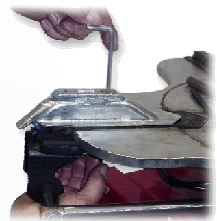
Clamp Carrier Upgrade Part No. 8184262